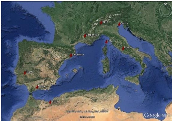
Figure 1. Locations of the 9 Mediterranean AERONET sites are found in the western basin with long time series used in this work.

Aerosol optical properties including the total and coarse mode aerosol extinction optical depth ( \tau_{\text{ext}} , \tau_{\text{ext-C}} ), Angstrom exponent ( \alpha ), size distribution, single scattering albedo (SSA) were examined using long-term ground-based radiometric measurements at nine Western Mediterranean sites: Oujda (N 34°39', W 01°53'), Malaga (N 36°42', W 04°28'), Barcelona (N 41°23', E 02°07'), Carpentras (N 44°04', E 05°03'), Rome_Tor_Vergata (N 41°50', E 12°38'), Ersar (N 43°00', E 09°21'), Ispra (N 45°48', E 08°37'), Venise (N 45°18', E 12°30'), Evora (N 38°34', W 07°54').